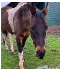
Ellia - 2005