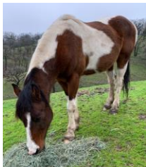
Brumby - 2005