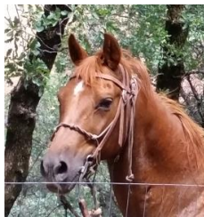
Shandelle - 2005

The Reeses traded their hot tub for Ellia, Brumby, and Shandelle when they were neglected babies. Brumby and Ellia are half-siblings. When they found Ellia, she was knee-deep in mud.